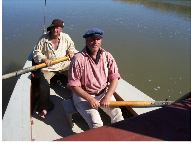
Members of Manuel Lisa Party rowing the keelboat General Ashley from the bow.

A great reliance in propelling the keelboat, strange as it may seem considering the nature of Missouri River navigation, was the wind. A mast was rigged with a square sail spreading about one Hundred square feet of canvas: which often gave sufficient power to propel the boat against the swift current of the river.