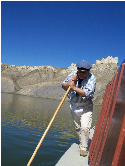
(Author poling the General Ashley)

There were many places where the keelboat could not be cordelled at all, as along sandbars where the water was too shallow for the boat to get near the shore, or the alluvium too soft for the men to walk in. At such times it was necessary to resort to the pole , as it was called. This was a turned piece of ash wood regularly manufactured at St. Louis. On one end was a ball or knob to rest in the hollow of the shoulder, for the voyageur to push against; and on the other was the wooden shoe or socket.