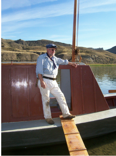
Author on the Keelboat General Ashley