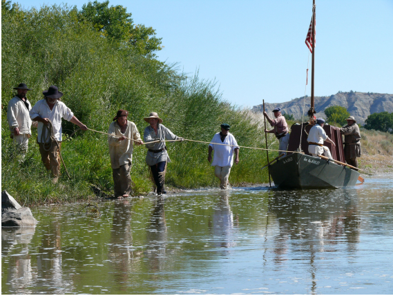
Manuel Lisa Party “cordelling” the General Ashley up the Missouri River (2008).

When the boat was being cordelled there stood at the bow, near where the bridle was attached, an individual called in French a bosseman (boatswain’s mate), whose duty it was to watch for snags and other obstructions, and to steer the boat by holding it off the bank with a pole. This man was selected for his great physical strength, prompt decisions, and thorough knowledge of the river. The patron , or master of the boat, stood at the rudder, which was manipulated by means of a long lever from the rear end of the cargo box. This position gave him an elevated point of view, from which he could overlook everything.